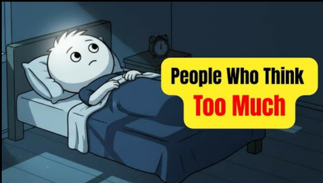
People Who Think Too Much